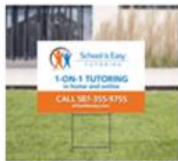
SCHOOL IS EASY LAWN SIGN - 18" x 12" - V2