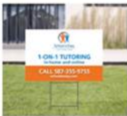
SCHOOL IS EASY LAWN SIGN - 18" x 12" - V1

We have a mix of traditional School Is Easy designs, and our new HERO branding. Both look great! All lawn signs are available for order via both of our dedicated School is Easy portals Safeguard and our new site OrderMyGear .