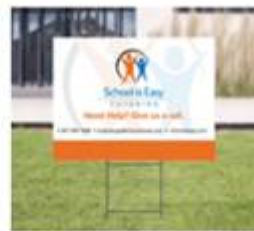
SCHOOL IS EASY LAWN SIGN - 24" x 18"