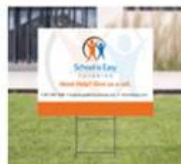
SCHOOL IS EASY LAWN SIGN - 24" x 18"