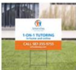
SCHOOL IS EASY LAWN SIGN - 18" x 12" - V1

All lawn signs are available for purchase via our dedicated School is Easy portal in Safeguard .