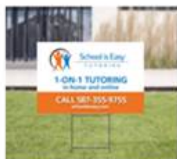
SCHOOL IS EASY LAWN SIGN - 18" x 12" - V2